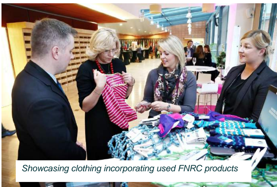
Showcasing clothing incorporating used FNRC products