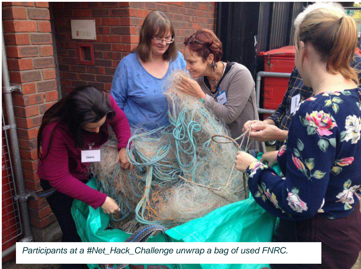
Participants at a #Net_Hack_Challenge unwrap a bag of used FNRC.

Net-Works empowers coastal communities in the developing world to collect and sell discarded fishing nets, which are recycled into yarn to make carpet tile. Net-Works is the result of a partnership between Interface and the Zoological Society of London. Website: http://net-works.com