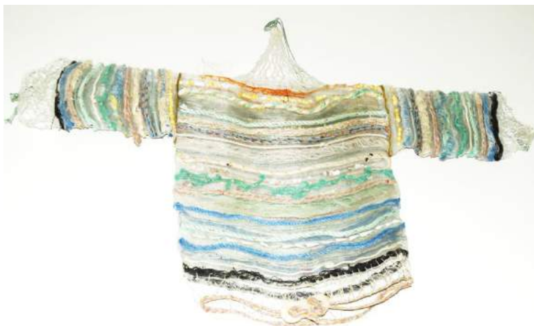
New clothing concept made from fishing nets and ropes.